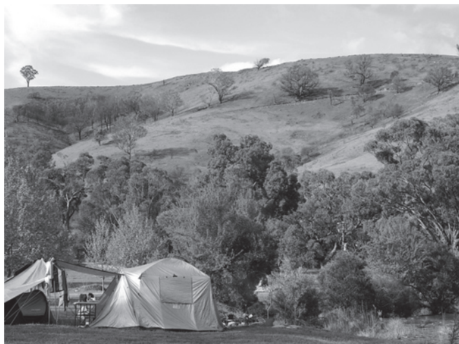
Micalong Creek Reserve near Wee Jasper (see camp 92 at map ref D4 opposite).